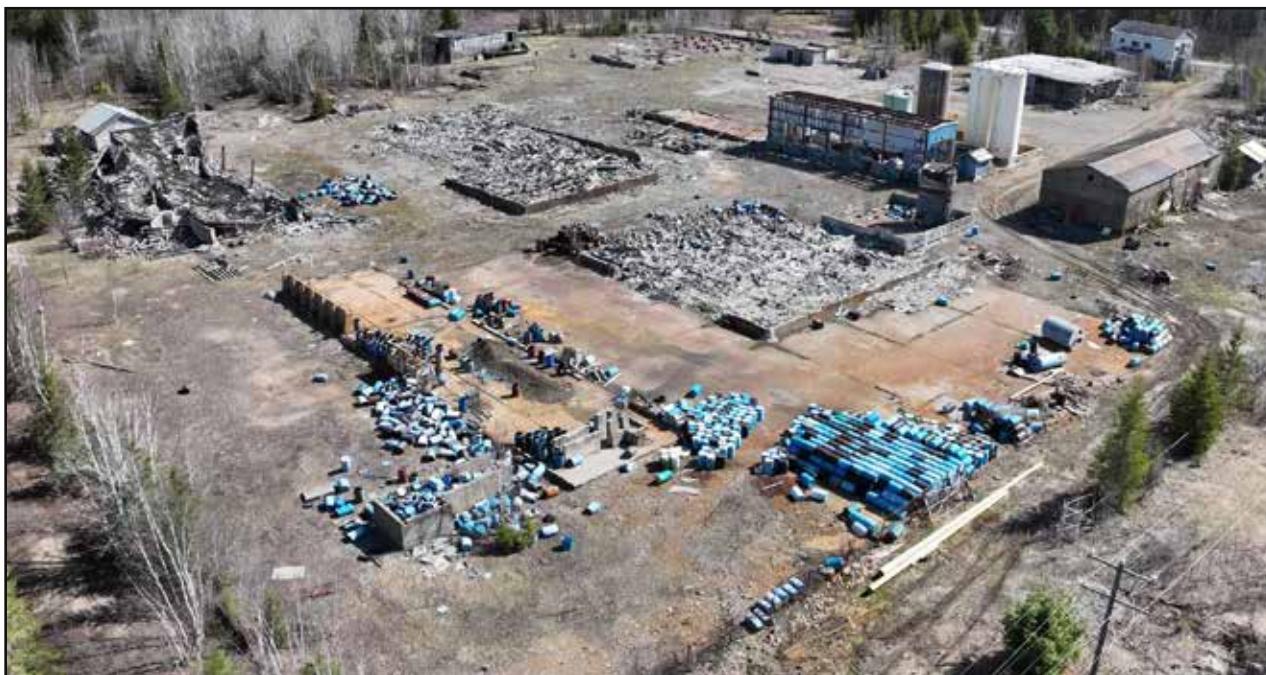
An aerial drone photo of the Cobalt Refinery property shows what the site looks like in its present form with barrels of waste and dilapidated buildings.

Sue Nielsen Local Journalism Initiative Reporter