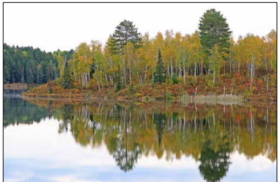
Scenic Sharpe Lake is a popular setting for boaters, anglers and cottagers. Cobalt is considering its options when it comes to Sharpe Lake Park.

"I'd like to see this moved to either closed (session) or another meeting, just because I'm not happy with the numbers that kind