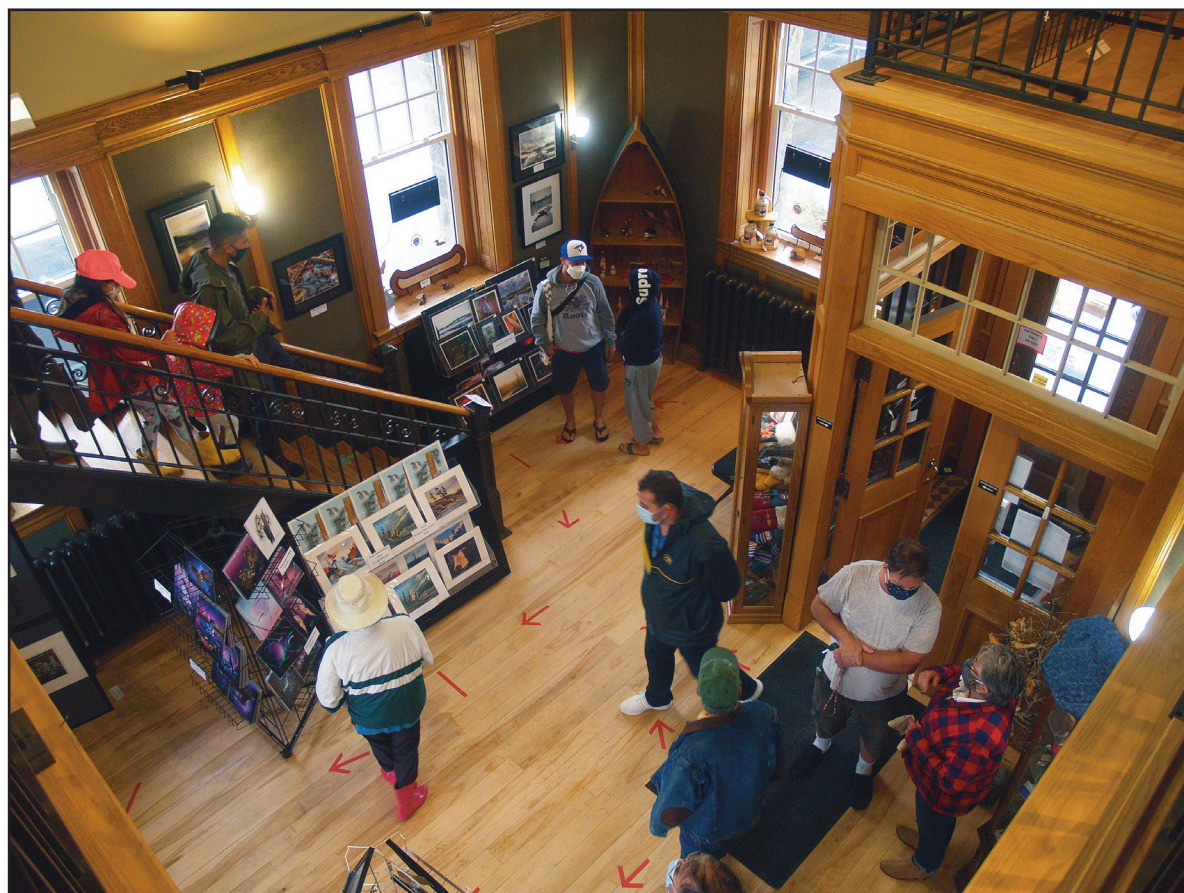
The Temagami Train Station is home to several organizations, including the Temagami and District Chamber of Commerce, but it also serves as a gathering space for special events – both indoors and on the grounds.

"It will be interesting to see what the results of the ONR survey will bring to our small Northern Ontario municipality and I am hopeful that the importance of passenger rail service will be recognized and acted upon. "The building has received some recent upgrades so the building is sound and we should be able to enjoy the benefits of having such a building in our town for many more years."