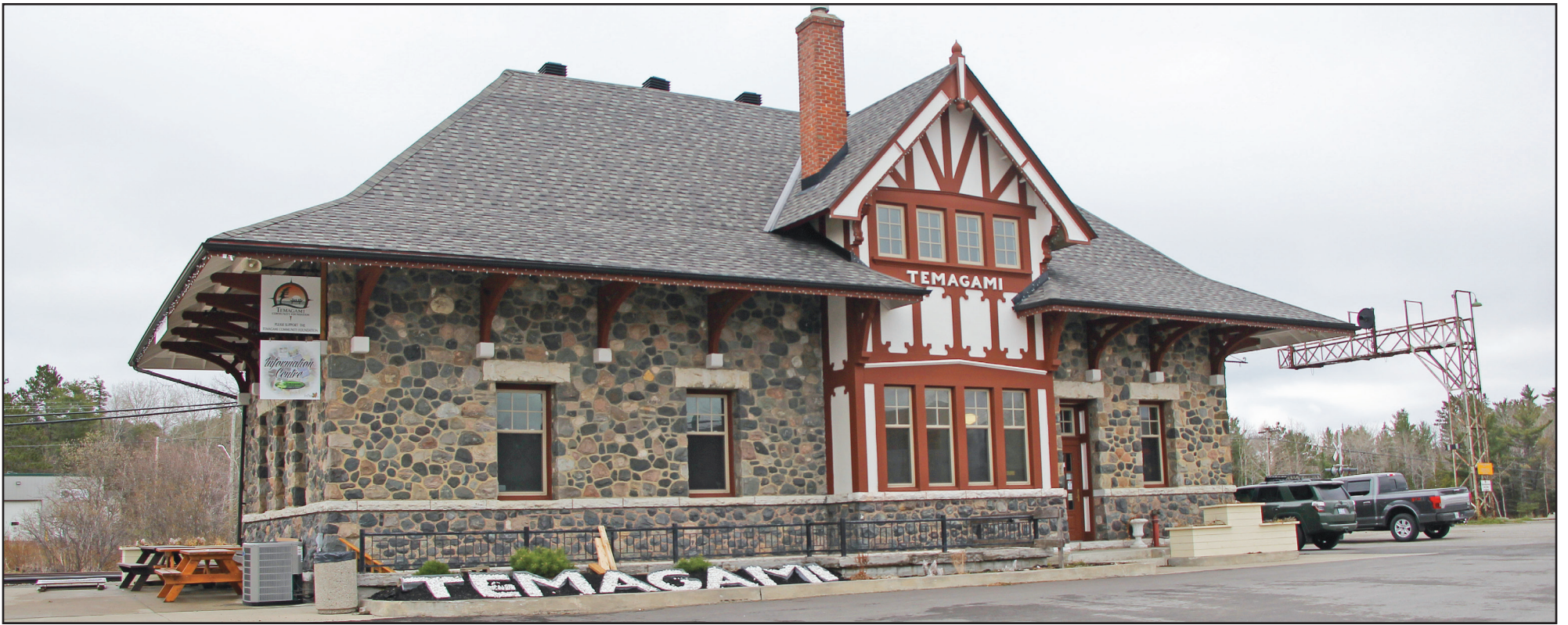
The Temagami Train Station is a landmark along the Northeastern Ontario rail line. Originally built in 1907, the building has changed over the years and now serves as a community hub.