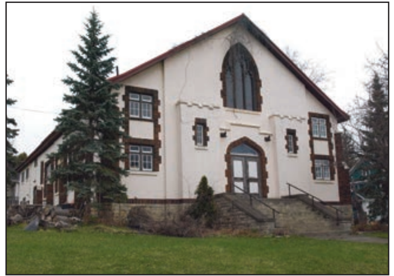
A Waterloo-based developer proposes to turn the former St. Andrew's United Church in Haileybury into five apartments.

Toute personne ou tout organisme public peut interjeter appel d'une décision du ministre concernant l'autorisation au plus tard 20 jours après que l'avis de décision a été donné. Si vous souhaitez qu'on vous informe de la décision du ministre concernant le projet d'autorisation, vous devez en faire la demande par écrit au ministre, à l'adresse ci-contre. Si la personne ou l'organisme public qui interjette appel de la décision ne présente pas d'observation écrite au ministre avant qu'il accepte ou refuse d'accorder une autorisation provisoire, le Tribunal d'appel de l'aménagement local peut rejeter l'appel.