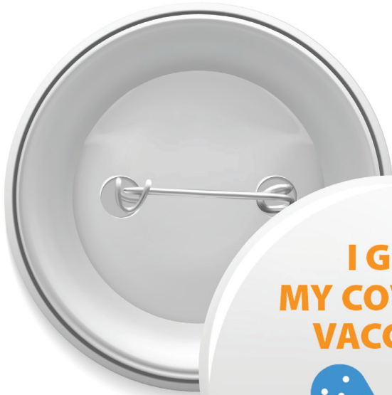
2 inch Buttons