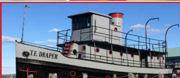
Ouvert du 20 juin au 11 septembre 2020, 10 h à 17h.

St-Eugène-de-Guigues is set in Northwestern Quebec's beautiful agricultural landscape. There are many opportunities available for the enjoyment of the great outdoors including camping, snowmobiling, and ATViing. Take some time to get to know and enjoy the great outdoors. Stop the car and take some time to smell the wild roses.