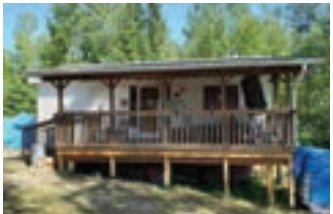
289894 Long Lake Road, Robillard $149,100 MLS # TM192020 Code: 8549