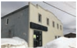
14538 Government Road, Larder Lake FOR LEASE $1,500 MLS # TM200726 Code: 8042