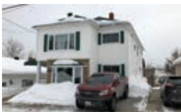
48 McCamus, Kirkland Lake $290,000 MLS # TM200485 Code: 6083

"Building lots in Matachewan" 171 & 172 Helen Ave. MLS# TM180298 $5,500