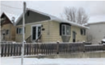
119 Main Street Kirkland Lake $95,000 MLS # TM200710 Code: 5242