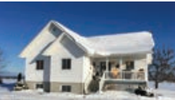
231377 Dairy Lane, Hilliard $375,000 MLS #TM 200208 Code: 3833