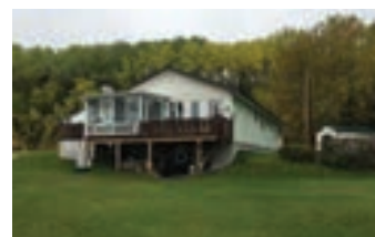
329615/ 329617 Hwy 560, Robillard Township TM200438 $295,000 Code: 9122