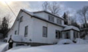
428 Farah Avenue, Temiskaming Shores TM200417 $119,000 Code: 4315