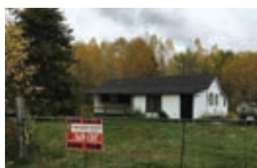
766215 Bear Road, Savard $89,900 EXCLUSIVE Code: 8532