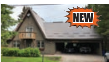
327039 Hwy. 560, Charlton-Dack MLS# TM200979 $315,000 Code: 8726