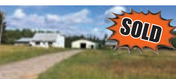
488199 Chamberlain Road 6 Chamberlain Township $130,000 MLS # TM200196 Code: 7256