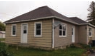
33 Tenth Avenue, Earlton $89,900 MLS # TM192168 Code: 3874