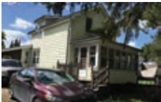
28 Seventh Avenue, Englehart $124,500 MLS # TM200229 Code: 7985