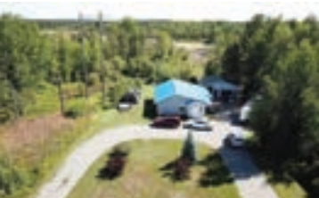
198 Burnside Drive, Kirkland Lake $175,000 MLS # TM192071 Code: 5185