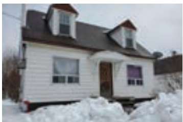
13 Connell Avenue, Virginiatown $49,000 TM200593 Code: 9641