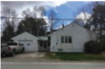
17 Tenth Avenue, Englehart MLS# TM200649, $129,900 Code 9159