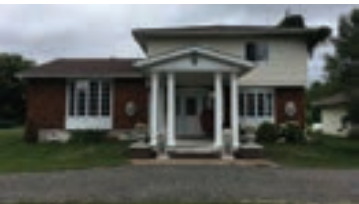
306251 Wendigo Road, Evanturel Township $359,900 MLS #TM 192108 Code: 555