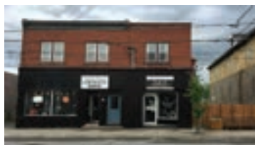
46 Third Street, Englehart $285,000 MLS # TM191347/191348 Codes: 4118 & 4648