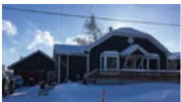
106 King Street, Englehart $149,900 MLS # TM200262 Code: 8741