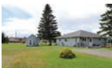
10 Diamond Street, Englehart $145,900 MLS # TM200291