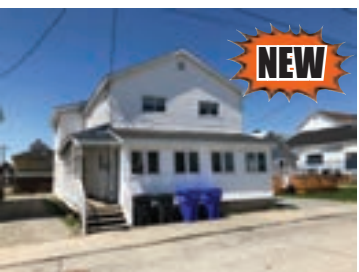
121 Duncan Avenue S., Kirkland Lake $157,900 MLS # TM200824 Code: 8079