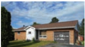
11 First Street, Englehart $134,900 MLS # TM190270 Code: 4316