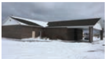
79 Fifth Street, Englehart $250,000 MLS # TM200069 Code: 5398