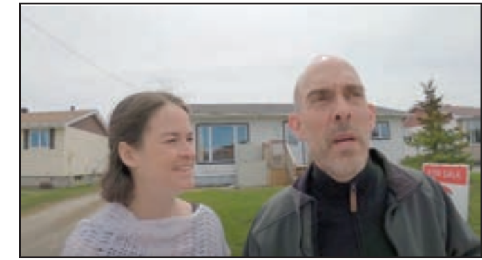
466 Ross Street, New Liskeard

YES, homes are still selling and there are active buyers searching the Temiskaming Area.