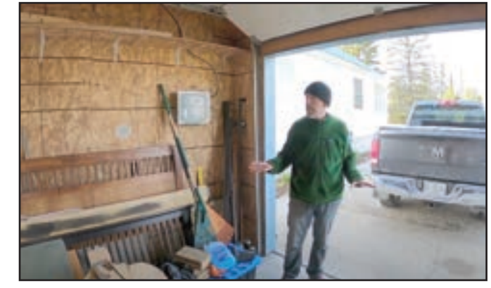
63 Howie Street, Charlton

WE PRODUCE VIDEOS FOR ALL OF OUR LISTINGS! CHECK OUT SOME OF OUR VIDEO TOURS ONLINE!