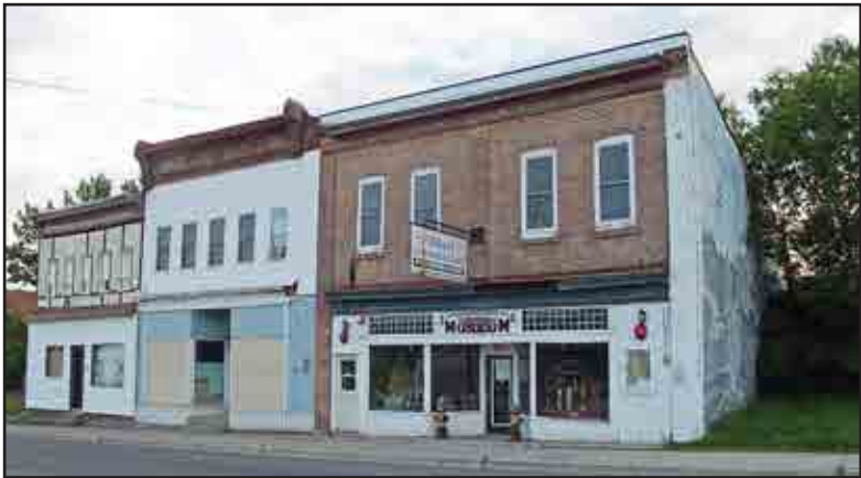
The Lang Street building housing the Cobalt, Coleman, Latchford and Area Food Bank, and the now closed Cobalt Northern Ontario Firefighters Museum, is experiencing costly structural problems and a quote is now being sought for the price of demolition. The two buildings immediately to the southeast, which share walls, are not part of the consideration.